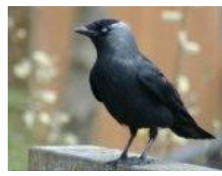
An Chág (jackdaw)