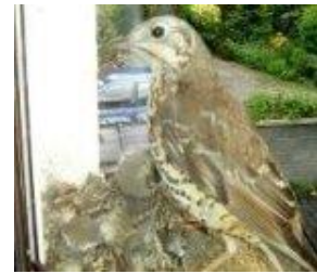
An Smólach (thrush)

Aimsigh an t-éan ón bhfuaim thíos i ngach ceist