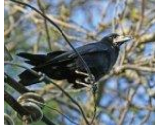
An Rúcach (rook)