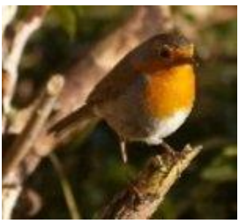
An Spideog (robin)