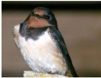
An Fháinleog (swallow)