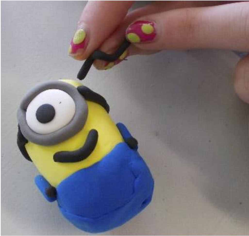
Minions sa Scoil!