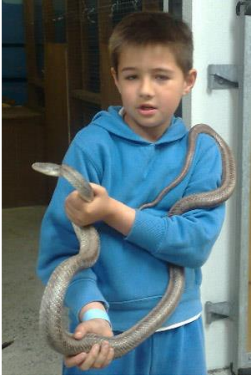
Bhí Ranganna 1 agus 2 ar thuras scoile i nGraune