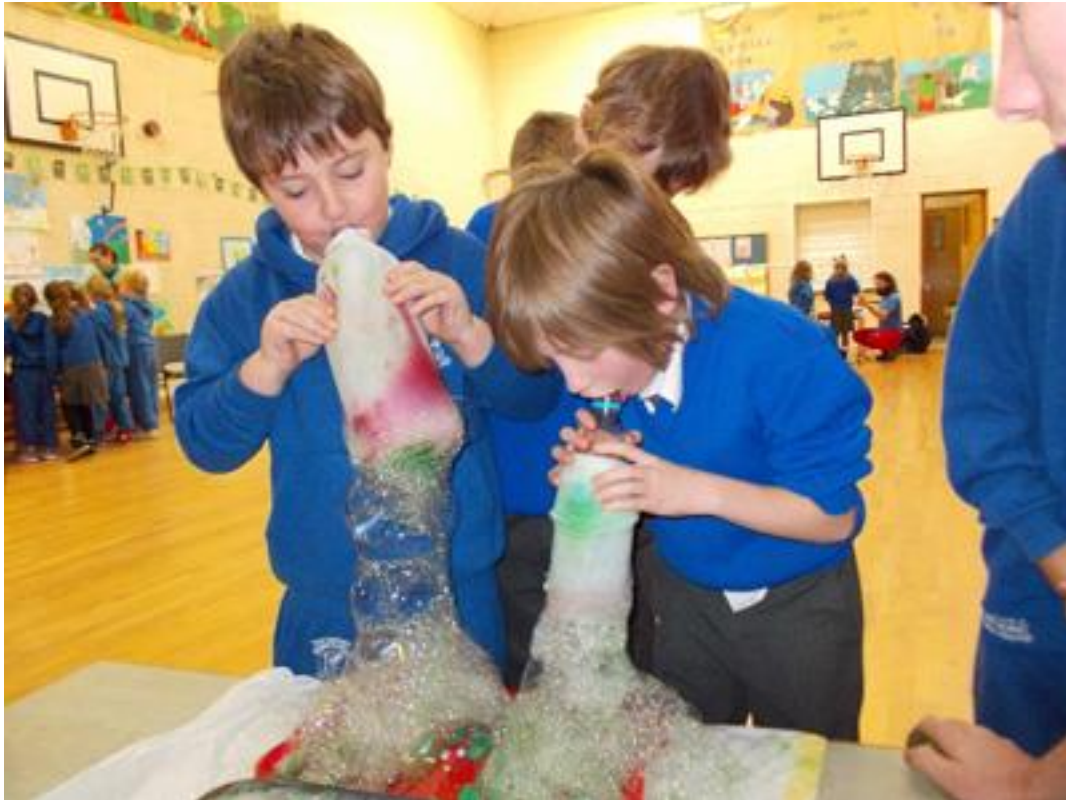
Turgnaimh déanta ag na micléinn ón GMIT