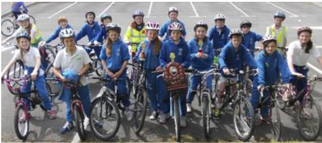
Duais ag an rothaíocht! Pix