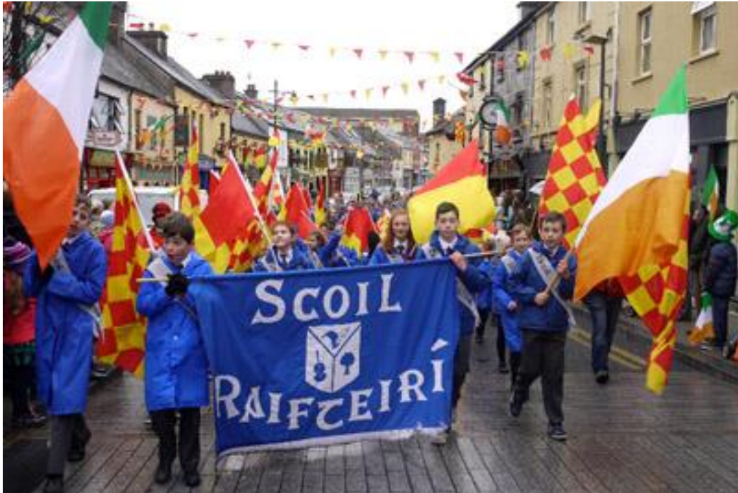
An Pharaid: Pictiúir Anseo