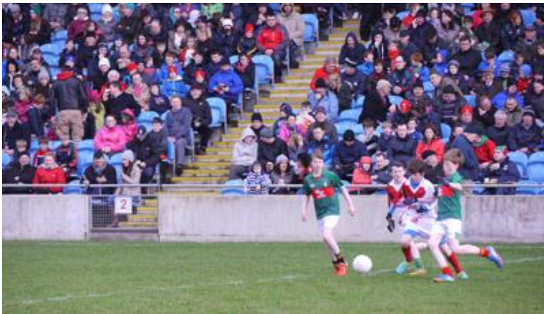
Bhí ochtar ó Scoil Raifteirí ag imirt ag leath am an an gcluiche den Sraith Náisiúnta idir Mhaigh Eo agus Corcaigh ag Páirc Mhic Éil. Pictiúir: anseo .