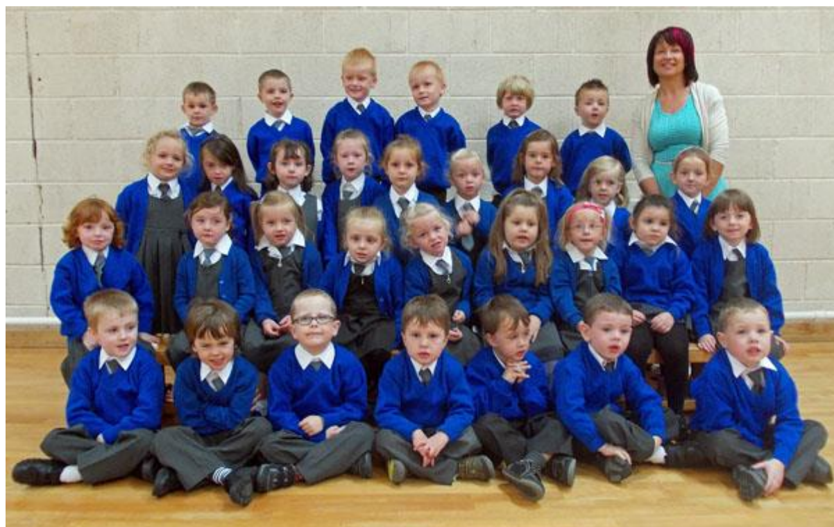
Click on the picture for large version

Clic anseo chun pictiúirí eile de na naíonáin nua a fheiceáil