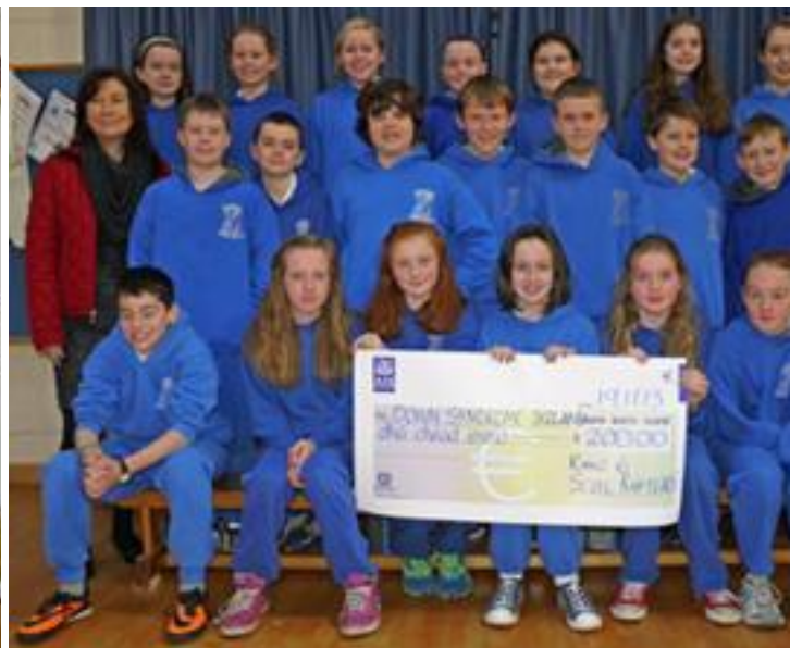
Bhailigh Rang 6 €400 an bhliain seo caite ag díolachán cácaí