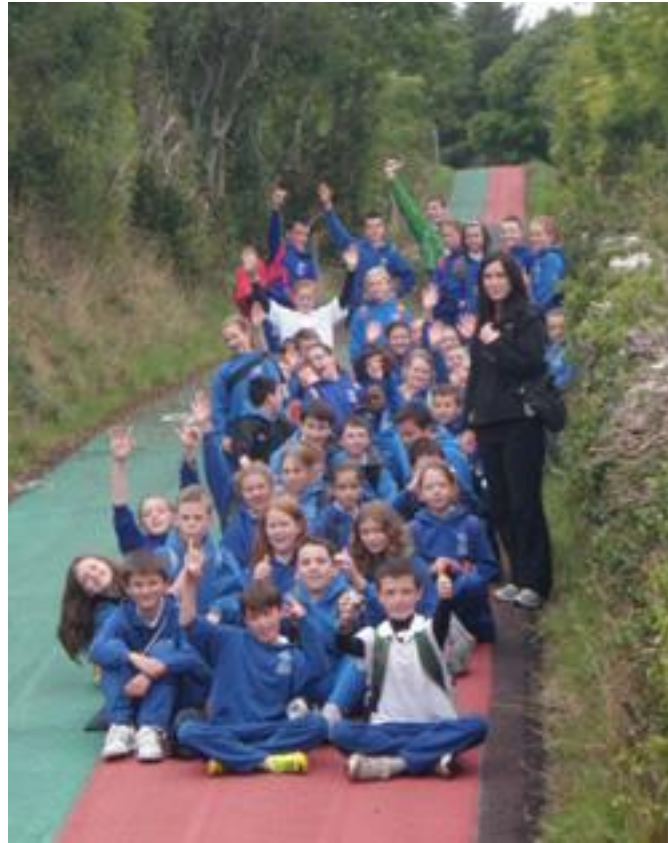
Clic anseo chun pictiúirí a fheiceáil ón tsiúlóid ar an mBealach Glas