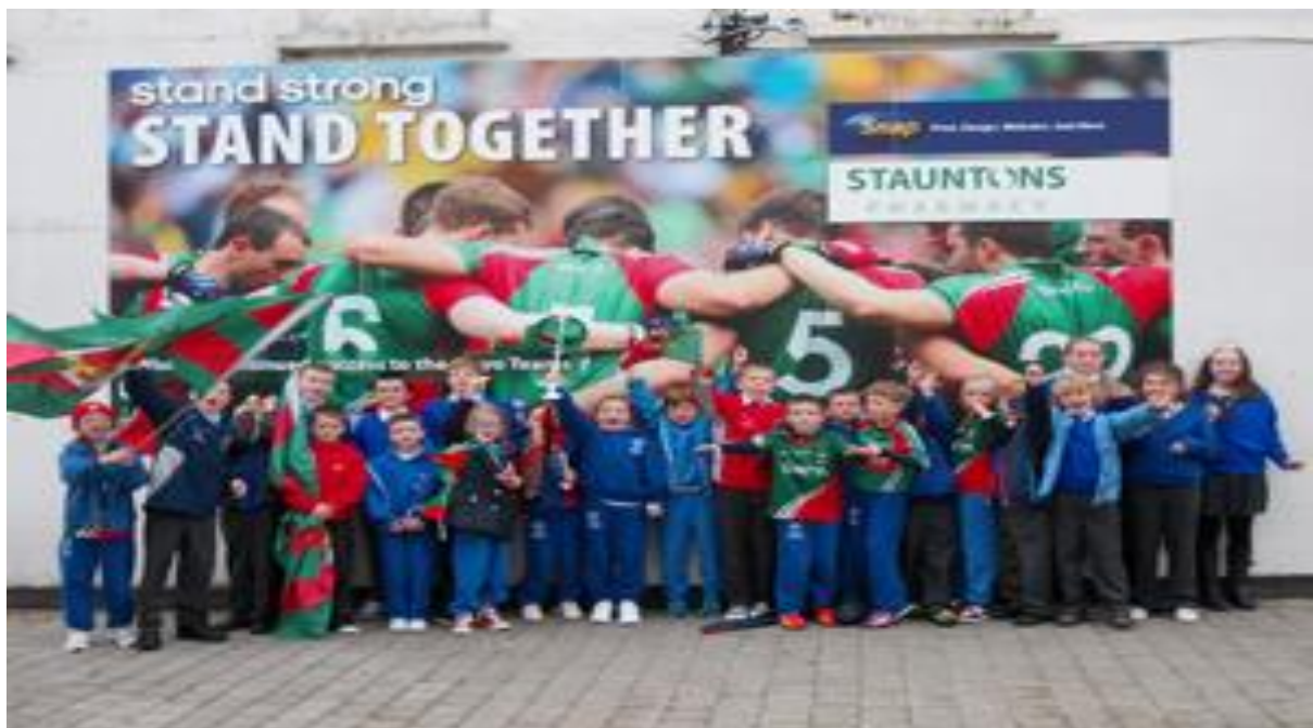
Chuaigh páistí ón scoil chun an corn Sam a fheiceáil i mBanc Ulaidh