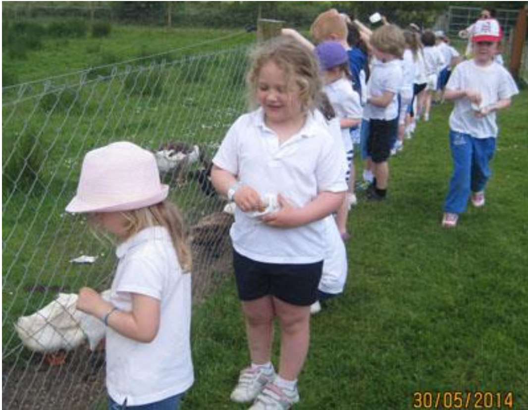
Naíonáin na scoile ag Graune mar thuras scoile