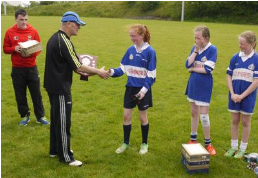
Bhuaigh na cailíní an Craobh !