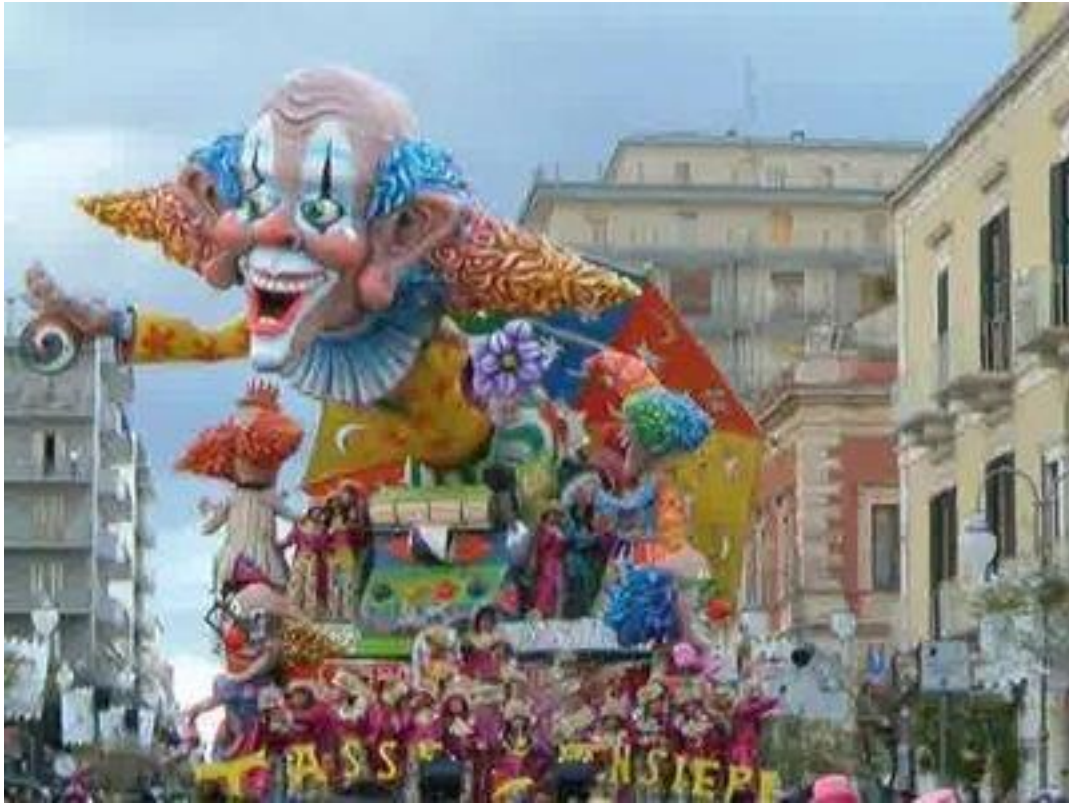
Lucia sent us these pictures from the Parade in Fano