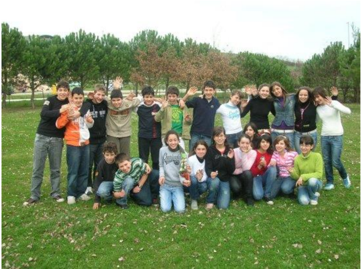
Agus seo Rang IID