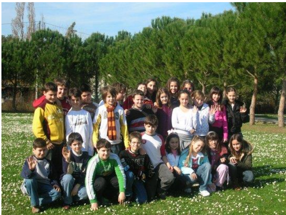
Questa è la Classe ID