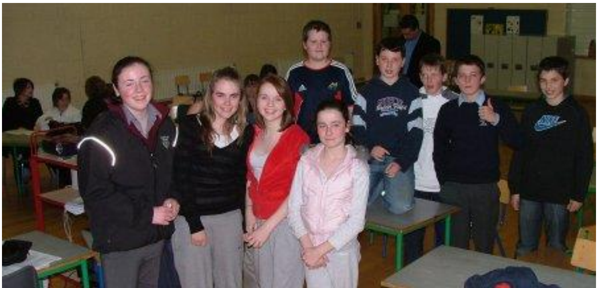
Past-pupils and parents at our meeting to devise the timetable (07.02.08)

Click here to see pictures and videos from the visit itself!