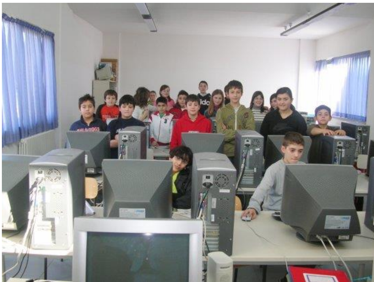
Ecco Classe IC della scuola