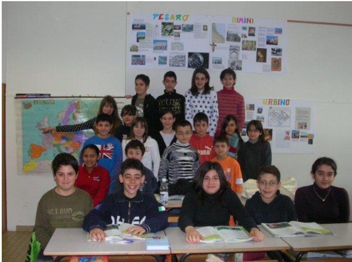
This is Class IB in our partner school