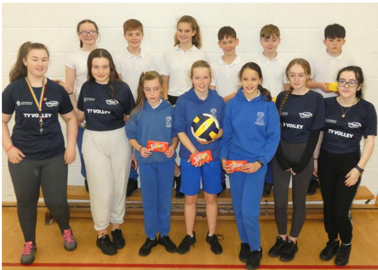
Spikeball i gColáiste Daibhéid. Pix anseo .