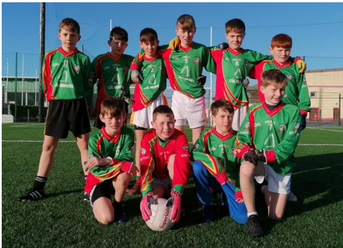
Foireann Mini-Sevens: ag dul ar aghaidh!