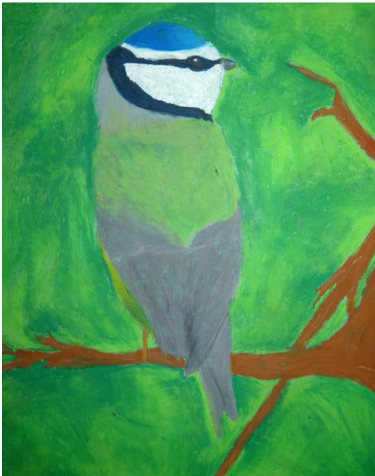
Pictiúir ó 2020