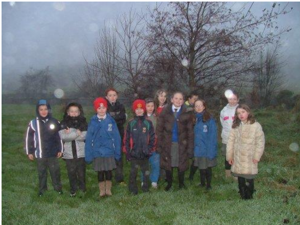
Ceo, drúcht agus cá bhfuil na duilleoga? Foggy dew, but not a leaf in sight.