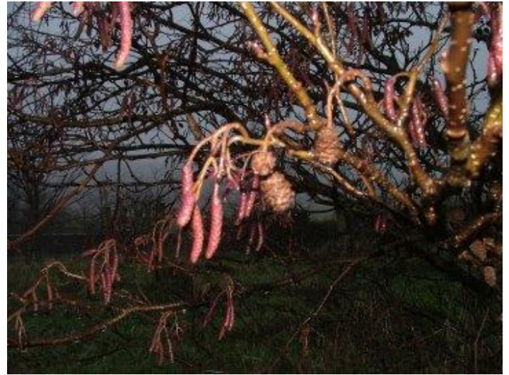
Buaircíní agus caitíní corcra