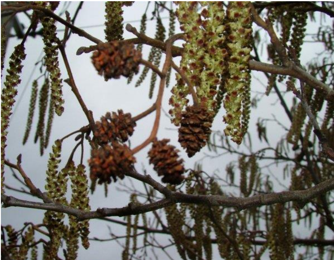
The cones open up to receive pollen