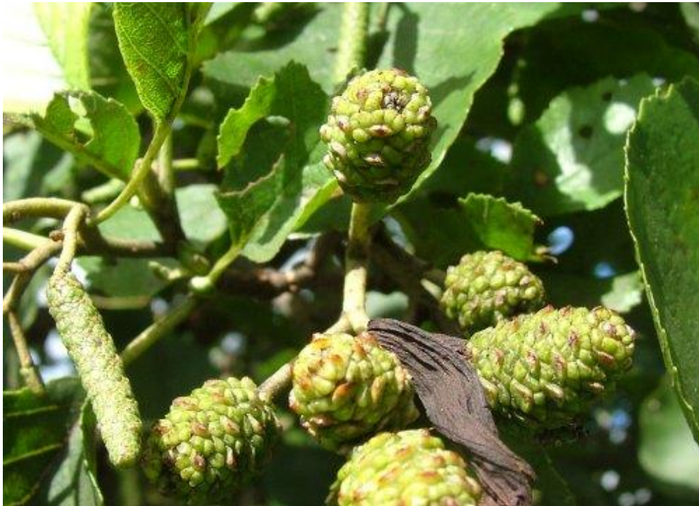
Seo na buaircíní. Beireann siad na síolta The Alder is unique as a deciduous tree which bears cones Tá na buaircíní fós glas agus cruá