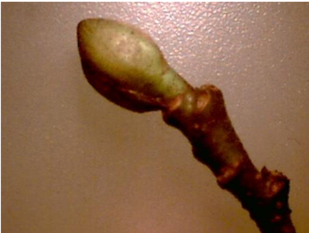
Seo an bhachlóg