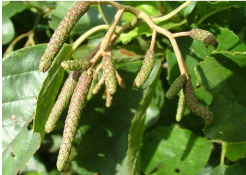
Seo na caitíní

Is iad seo an chuid fhireann (male part) den chrann