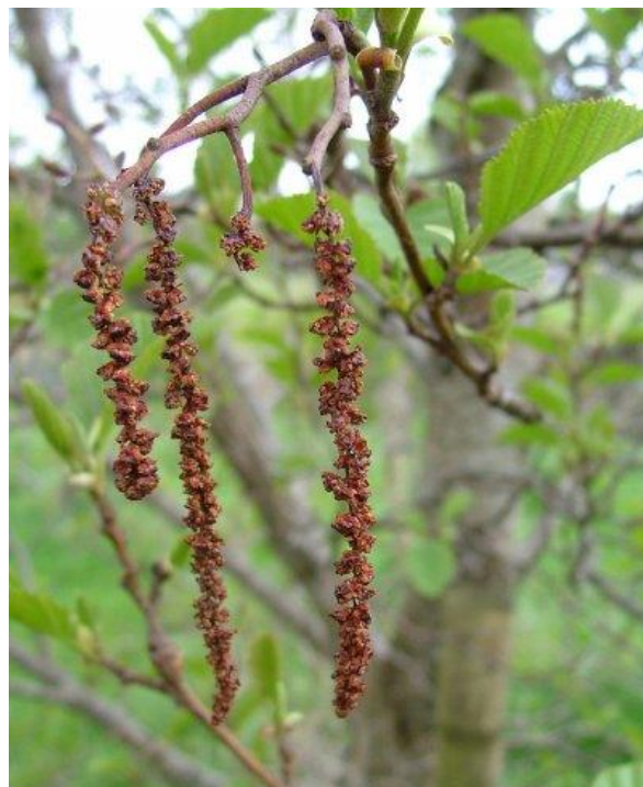
Seo na caitíní deireannacha

The other catkins have dried up and fallen by now