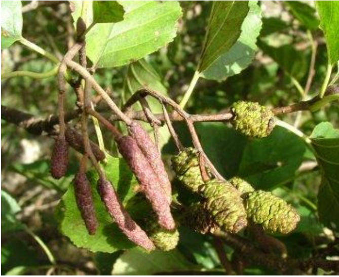
Tá na caitíní ag éirí corcra freisin