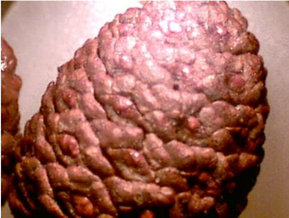
Seo an buaircín faoin micreascóip