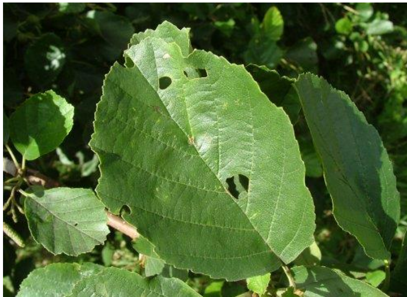
Seo an duilleog

The catkins are starting to turn purple and are still hard