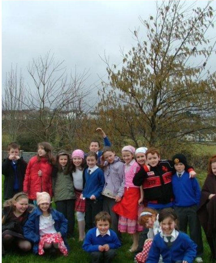
Ag gléasadh suas do Sheachtain na Gaeilge