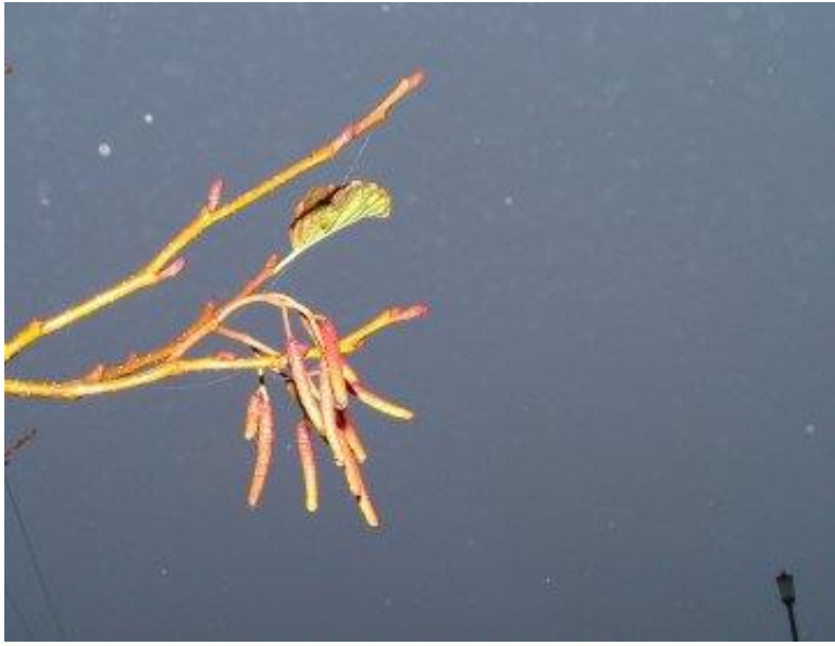
An duilleog deireannach: the last leaf