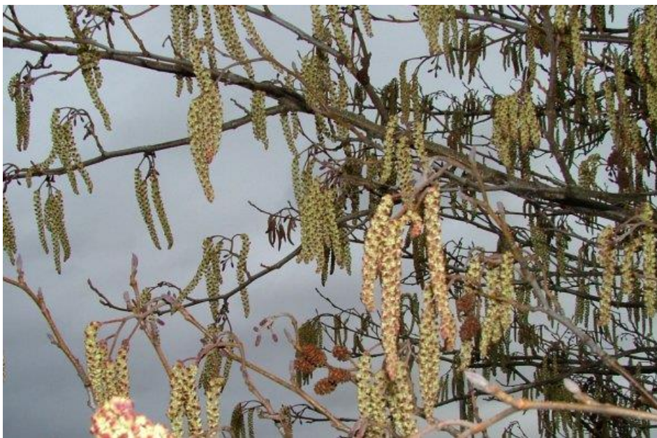
Féach ar na caitíní anois!