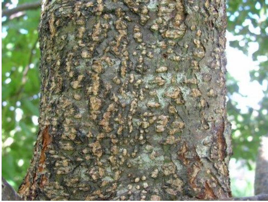
Seo an choirt gharbh ar an stoc. The bark of the trunk is rough and fissured