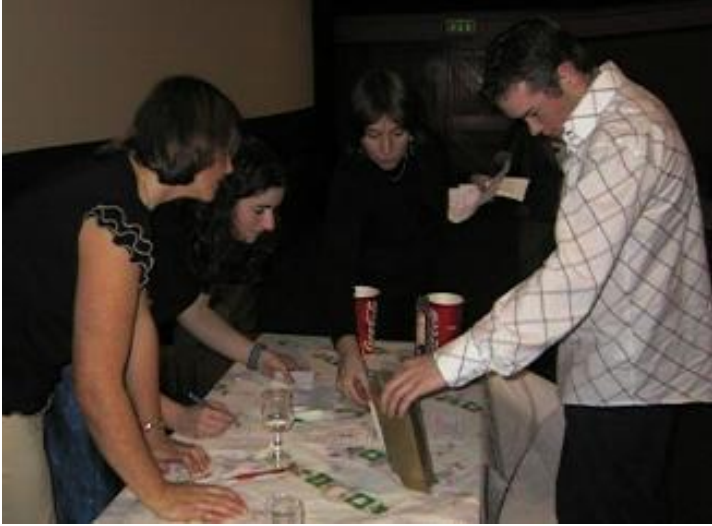
Bhí crannchur againn freisin. Above is one of the winners. Míle buíochas do ghach duine a thug urraíocht dúinn chun raon maith duaiseanna a bheith ar fáil.