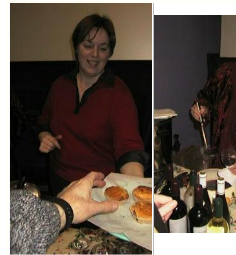
First, we had mince pies...