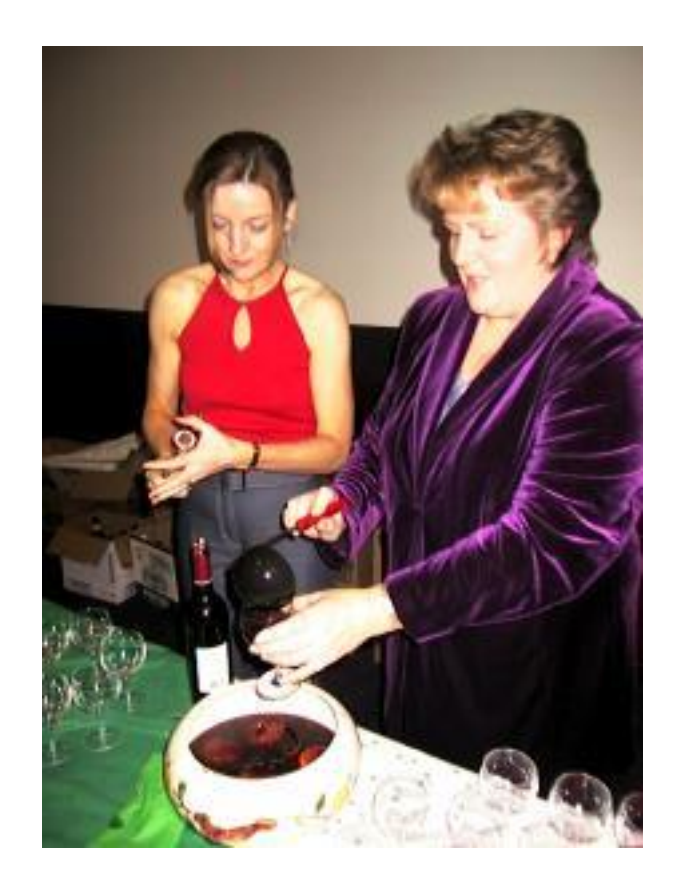
Buíochas mór le gach duine a thug cabhair dúinn